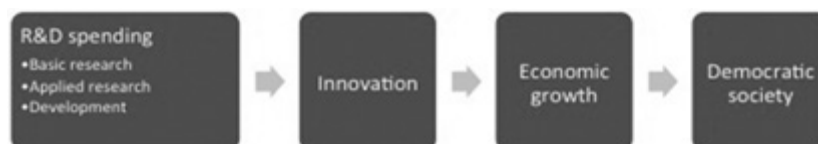
Fig. 1: Schematic depiction of the innovation policy narrative (Drawn by the author)

because it is so entrenched in statistics (Godin 2009, 27). Similarly, while there are reasonable doubts about the underlying assumptions of the narrative (Wladawsky-Berger 2018), and attempts to come up with alternatives (Nowotny 2016), it seems fair to say that the innovation policy narrative remains convincing for policy makers thus far.