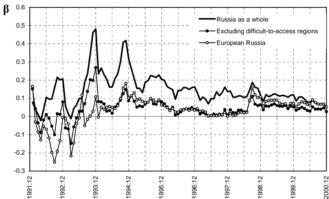
Figure 2. Evolving integration of market for beef

Figure 3 demonstrates the evolving pattern of integration in the market for sugar. It differs sufficiently from the patterns for the markets discussed above as well as for the aggregated market of 25 staples. First, there are no indications of substantial segmentation in the early years of transition that is peculiar to other markets. Second, beginning as early as the second half of 1993, the degree of integration of the sugar market remains more or less stable.